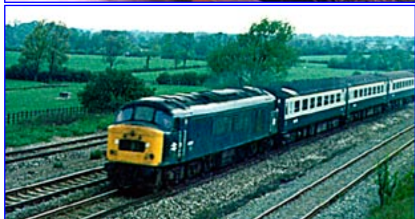
The 45/46 Classes were quite capable of running at speed when conditions allowed, such as here at Wistow, near Market Harborough.