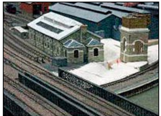
These pictures taken during the construction of the layout can only give an indication of what a fine model this really is...