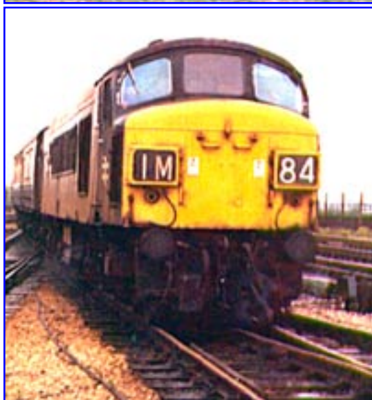
Top: Nearing the end of its active career Peak 45 110(?), with plated over indicator box, prepares to leave Coalville with a train load of ballast.