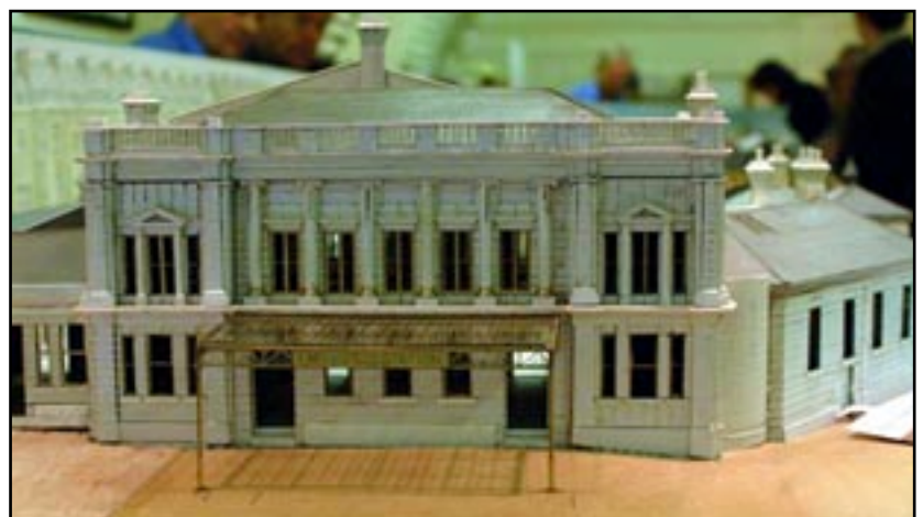
Top: The sheer scale and intricacy of the train shed roof, built using custom etchings, is truly breathtaking. Above: The rear view of the engine shed complex. Below: The grand frontage of the former Somerset and Dorset Joint Railway's principal station is accurately captured by the Taunton group's modellers.