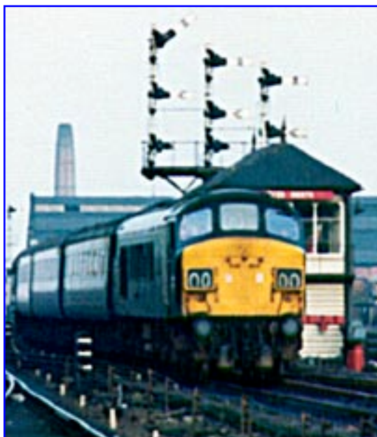
Below: Another split headcode locomotive is seen approaching Leicester London Road Station.

THE 'Peaks', introduced in 1959 as part of the BR Modernisation plan, were a relatively long-lived group of locomotives and generally well liked by both enthusiasts and enginemen.